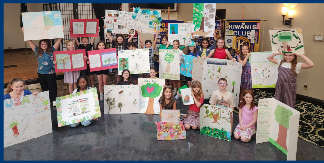
2025 Third grade winners

The Kiwanis Club of Medina gave thornless honey locust seedlings to every third grader in Medina. Each student created a tree project for Arbor Day, and the winners from each class presented theirs at our April 24 lunch meeting.