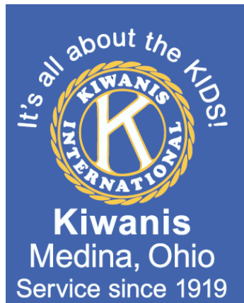
Logo #1 - Kiwanis Logo