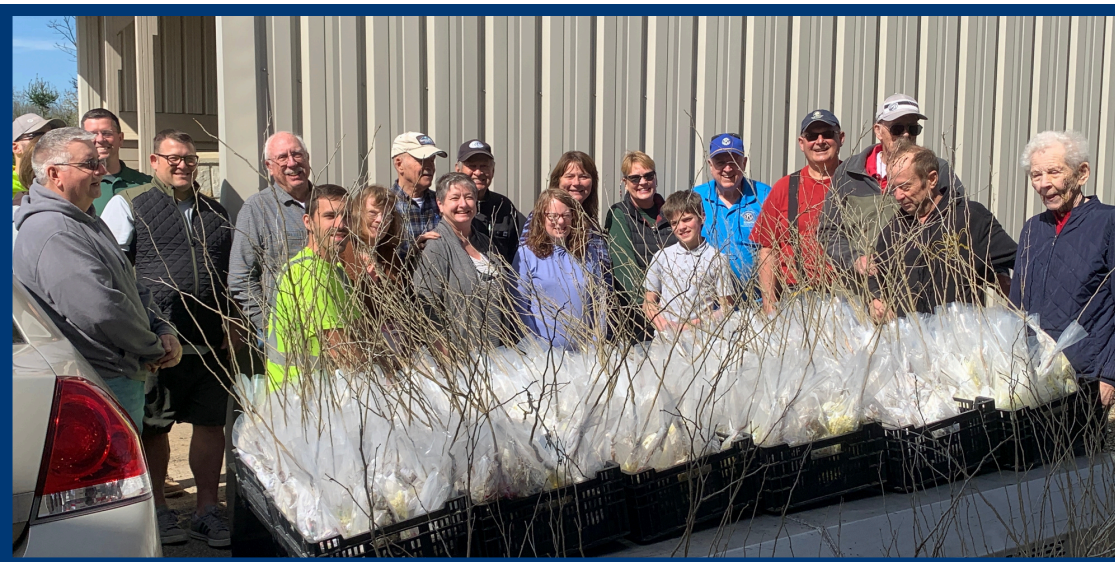
The Kiwanis Club of Medina along with Breakfast Kiwanis, the Medina Shade Tree Commission and Medina City forestry staff bagged 600 thornless honey locust saplings.

The Kiwanis Club of Medina gave thornless honey locust seedlings to every third grader in Medina. Each student created a tree project for Arbor Day, and the winners from each class presented theirs at our April 24 lunch meeting.